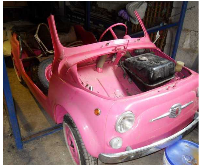
Fiat Jolly Giardiniera

I have a beautiful English Heritage Buildings oak frame 47-foot garage I contracted